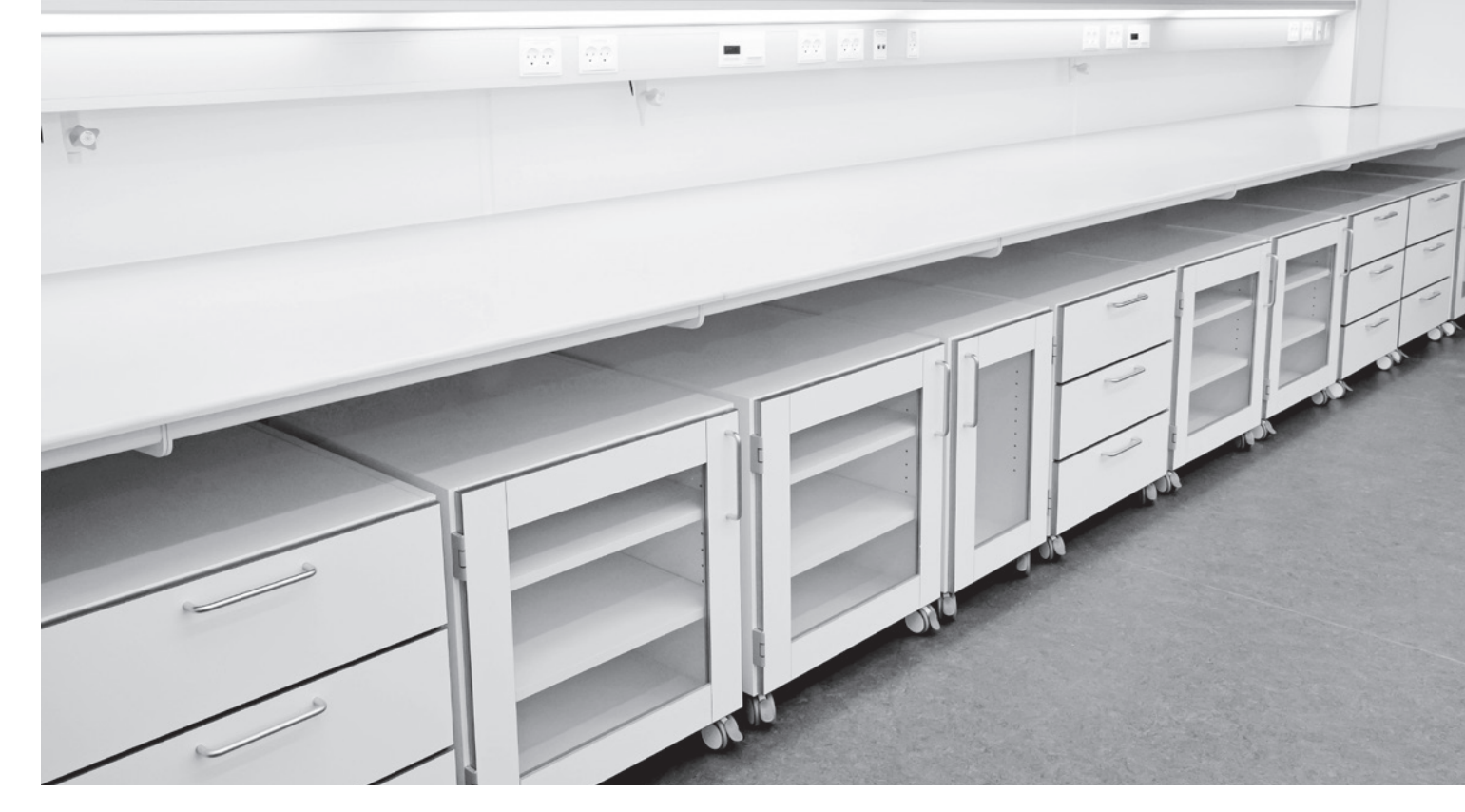
glass doors with laminate frame