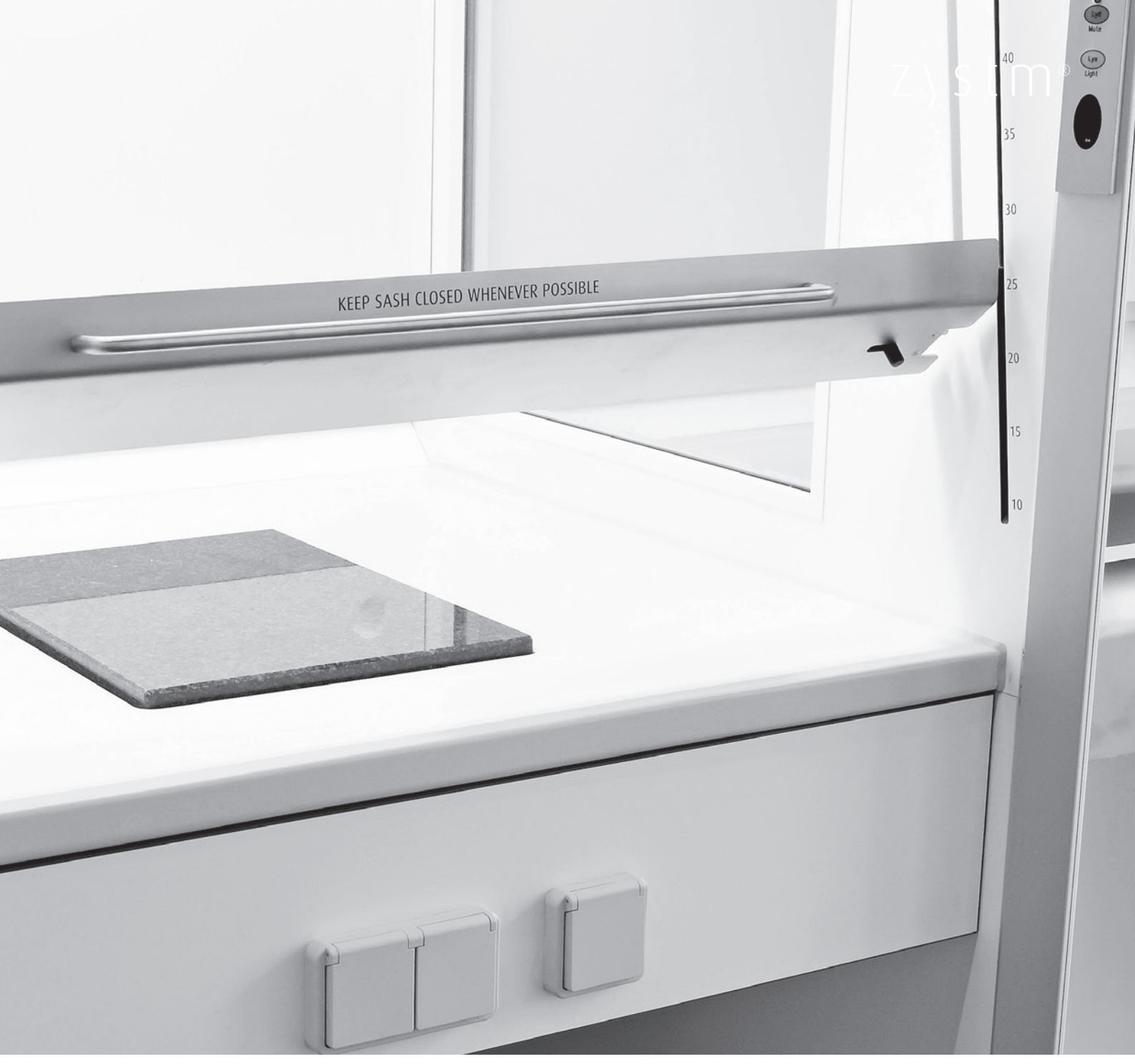
protected work station with counter top anti vibration inlay for balance