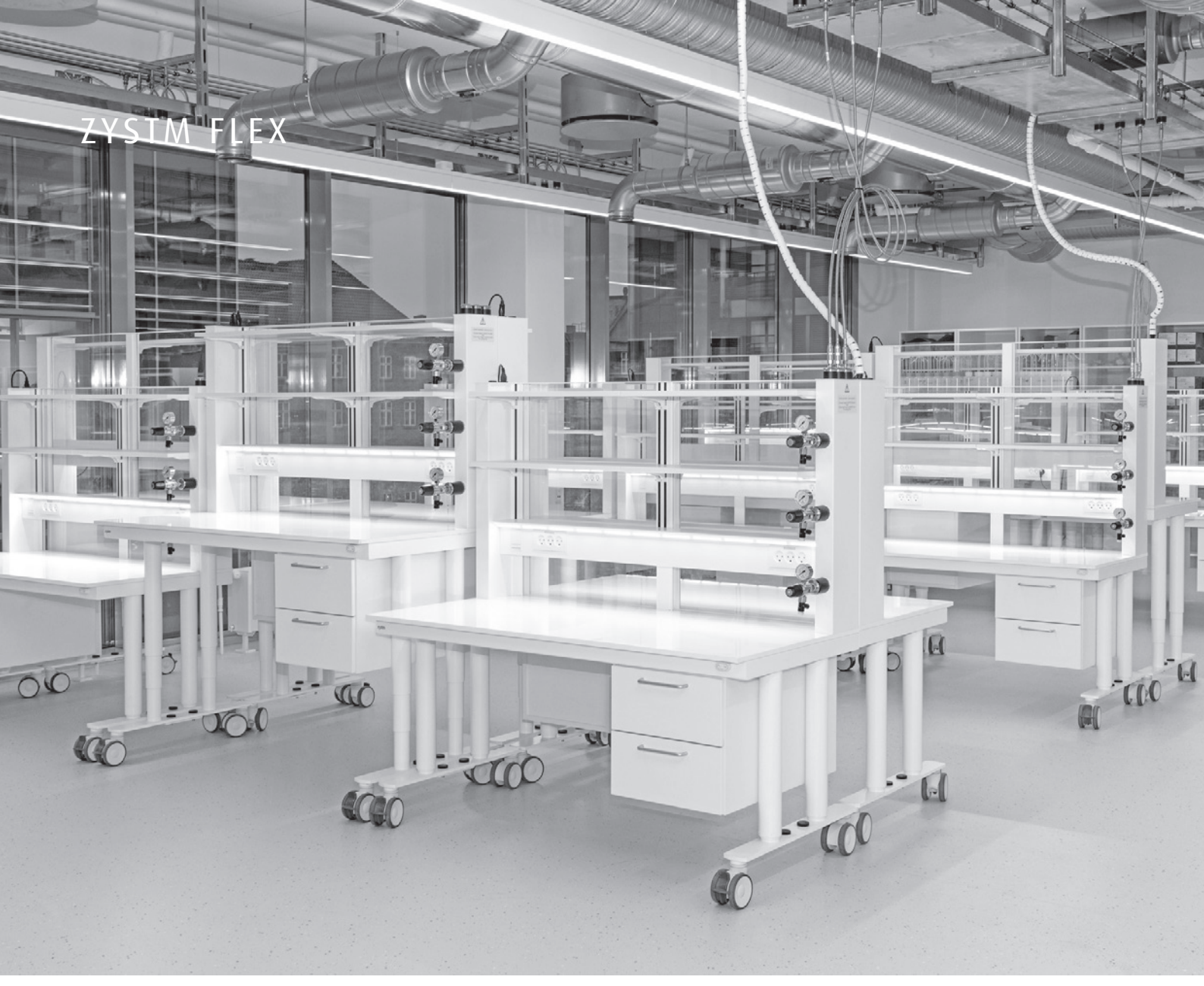
when flexibility is a demand.

height adjustable tables with extra stability and load capacity.