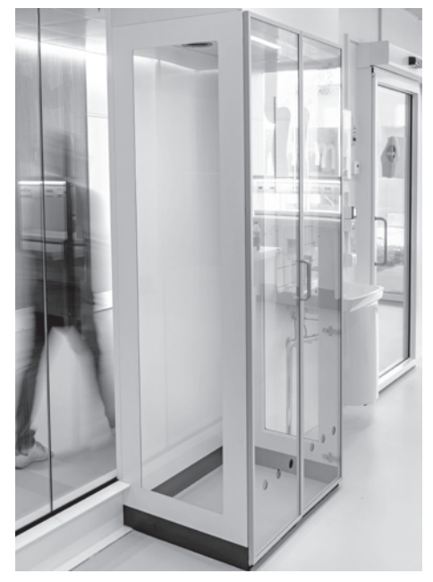
parking cabinets with glass sides