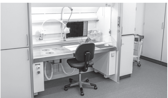
complete workstation in pathology ergo zafe 19 fume cupboard for excision and histology incision