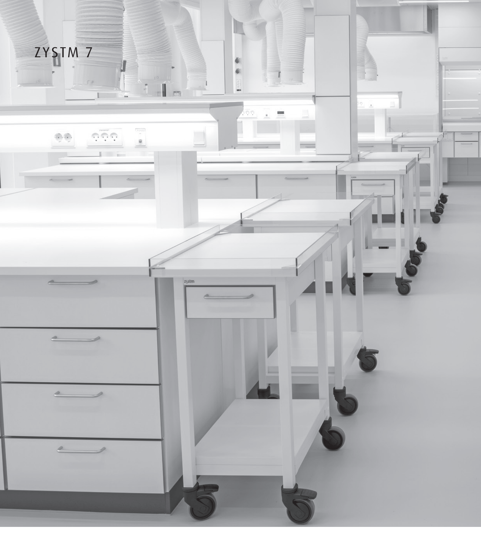
cabinets on plinth