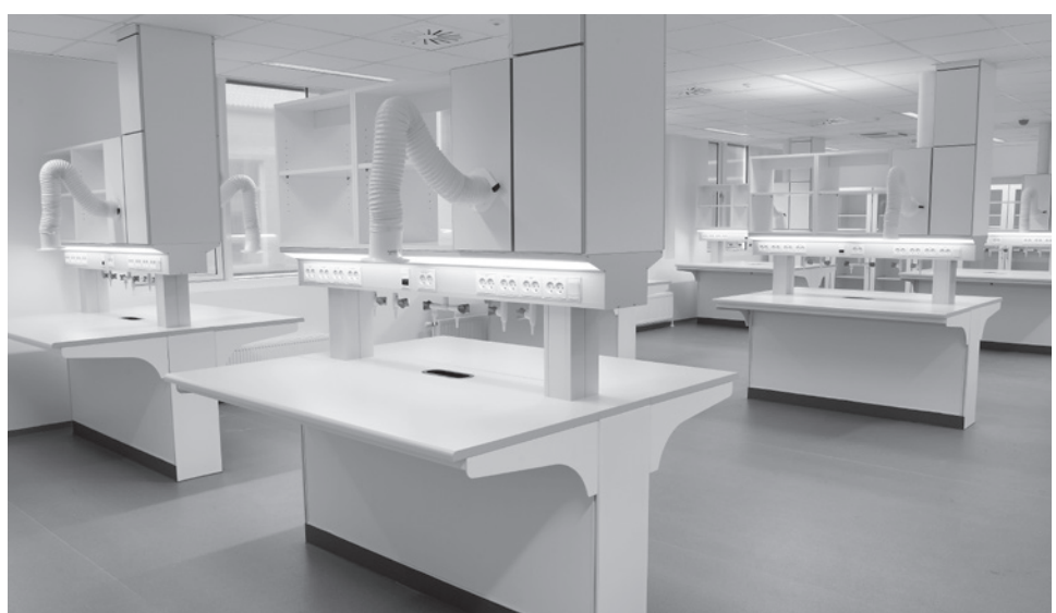
manually adjustable tables