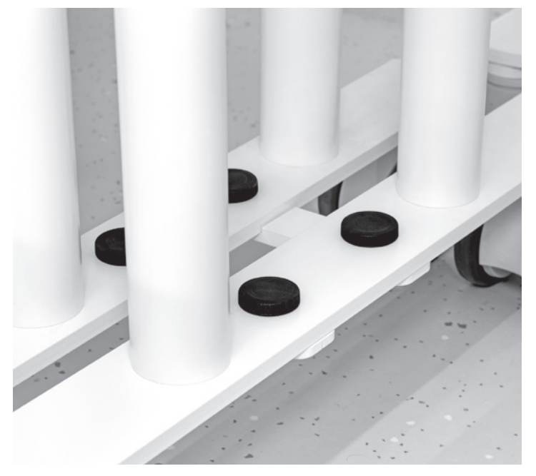
fixing and locking option for Zystm flex (mobile tables)