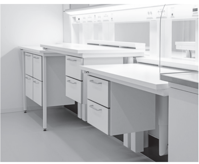
Zystm 3 and 5 with rear edge extraction