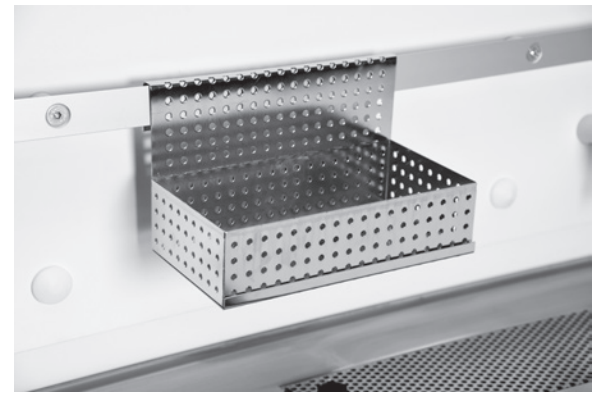
suspension slide clamp for accessories