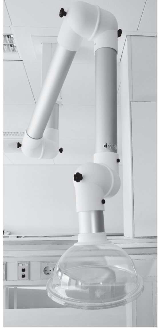
wall mounted extraction arm.