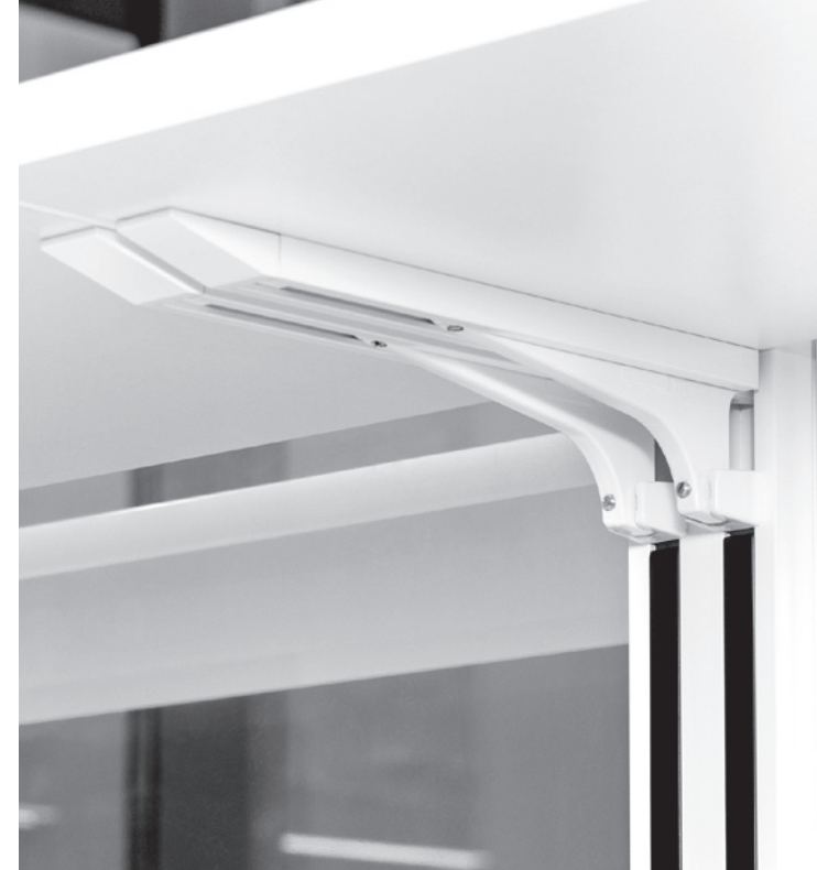
connection to house installation with Zystm flex