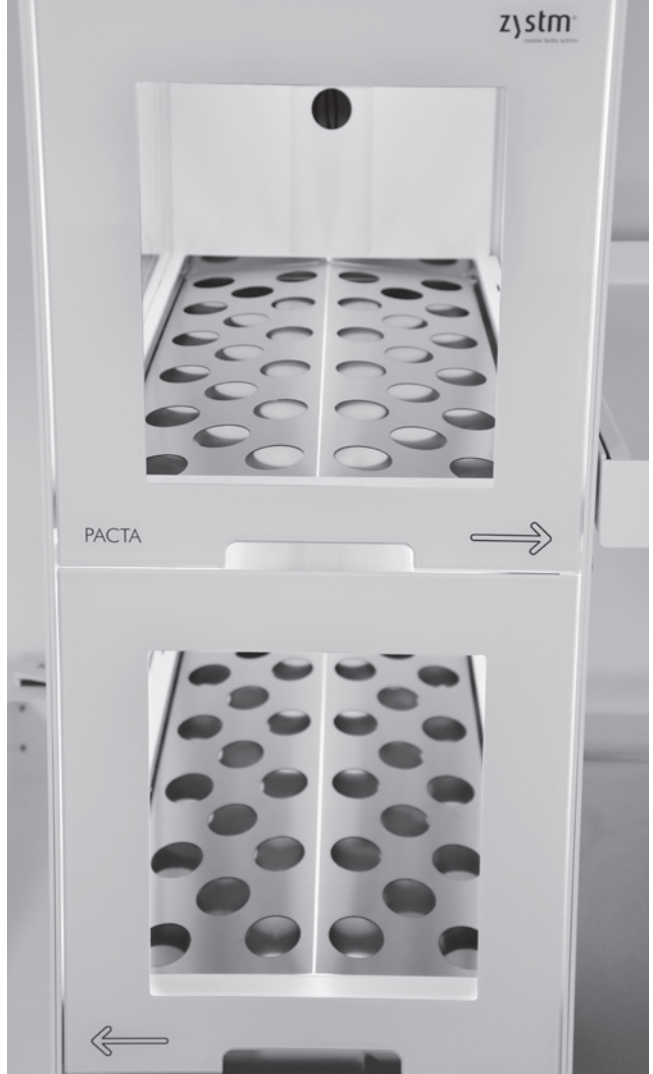
PACTA is dedicated to provide uncompromised safety, saving space and energy, easing operations for end users and maintenance staff.

PACTA is constructed modularly according to customer requirements and is available in height-adjustable or fixed working height