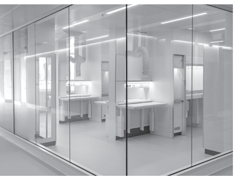
height adjustable workstations in Zystm 5 with local point extract to worktop