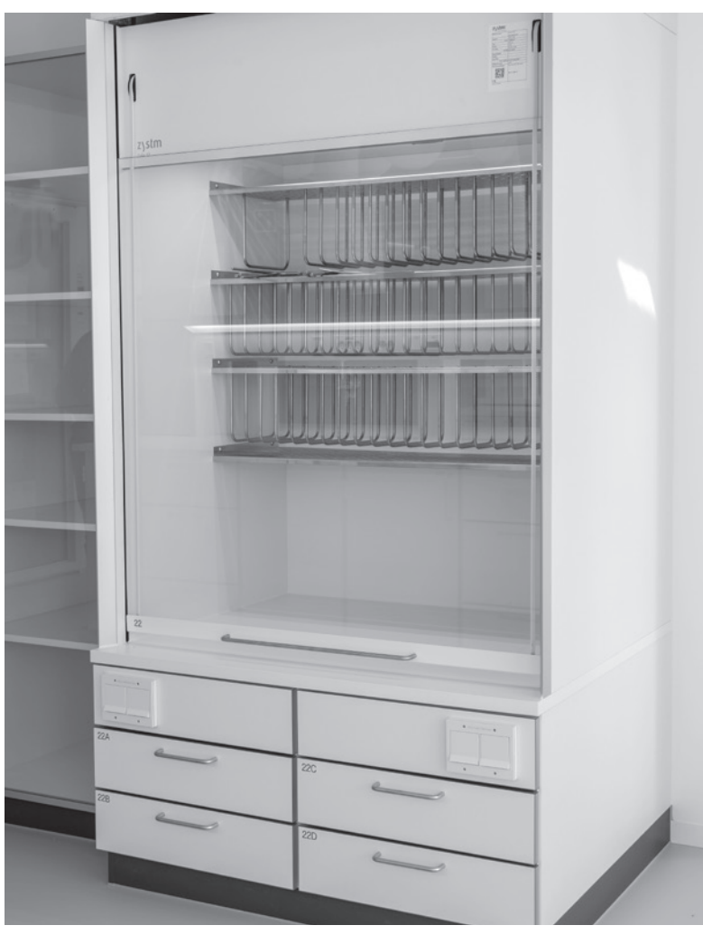
custom made ventilated cabinet