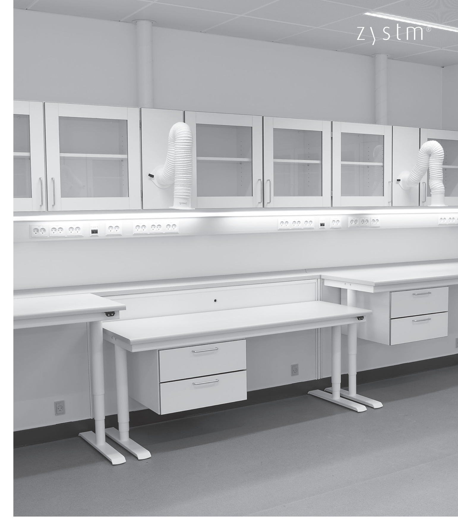
height adjustable table system for seated/standing. Prepared for suspended cabinets