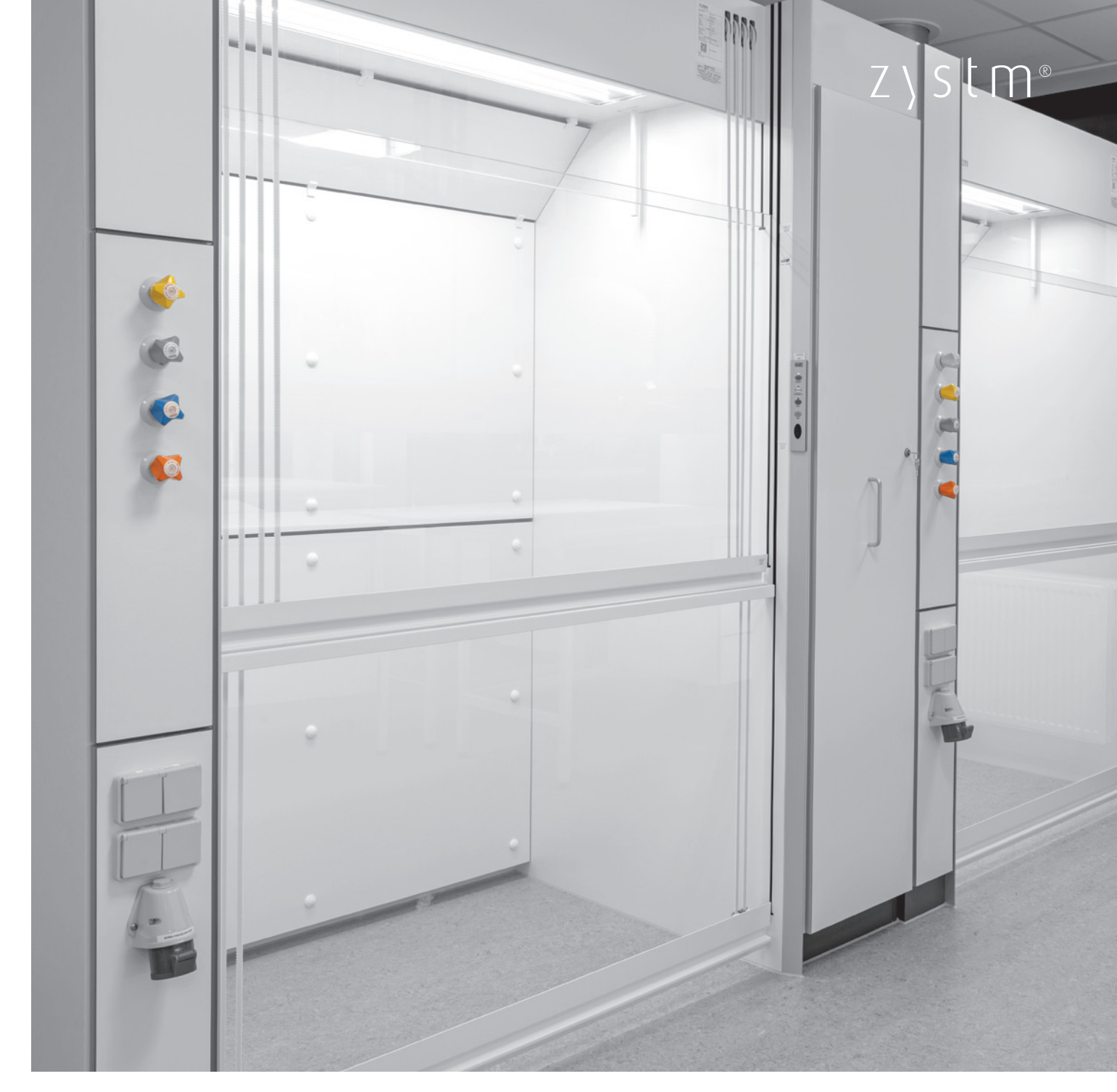
protected workstation with table for counter weight - walk in zafe 87 fume cupboard