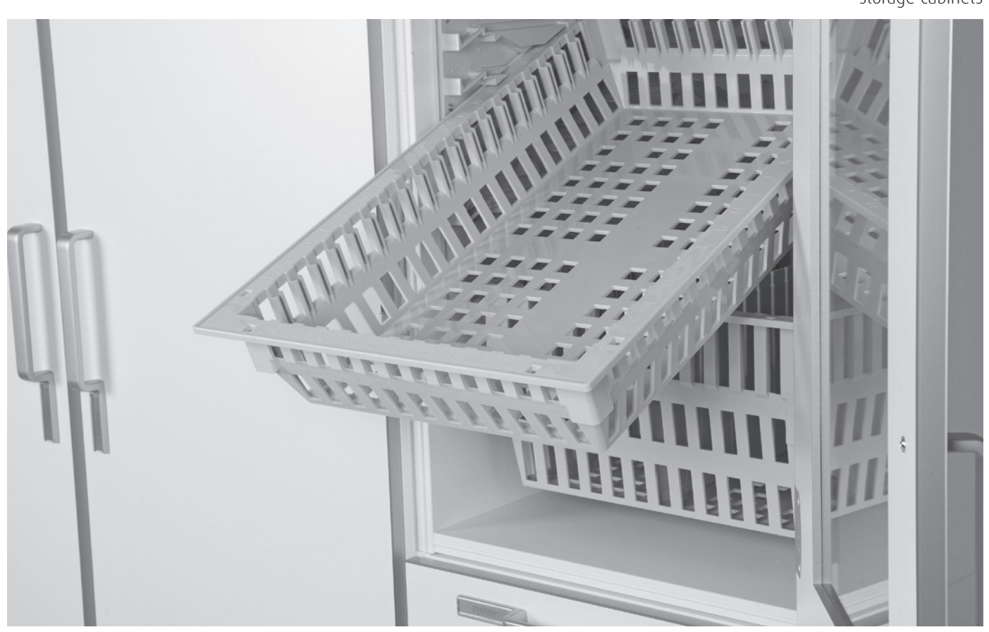
extract or tilt for modules in standard storage cabinets