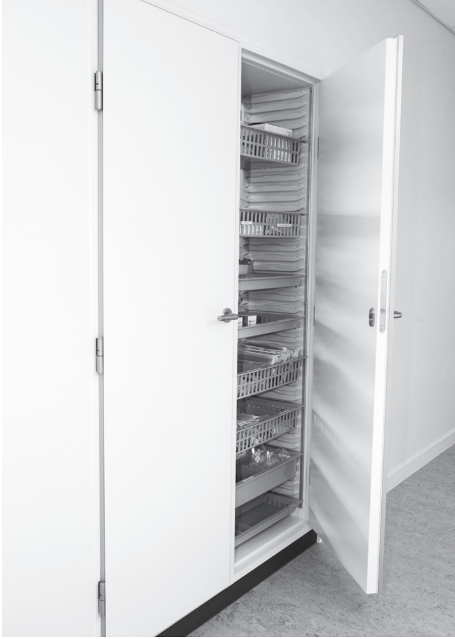
pass through flammable cabinet for modules