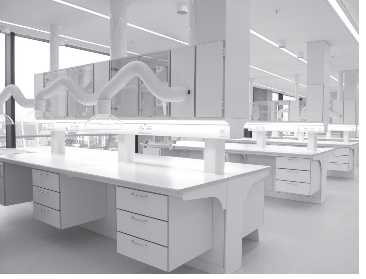
suspended drawer cabinets on Zystm 5