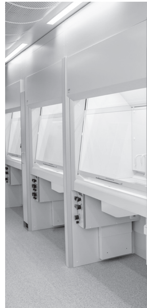
fume cupboard with angled sash