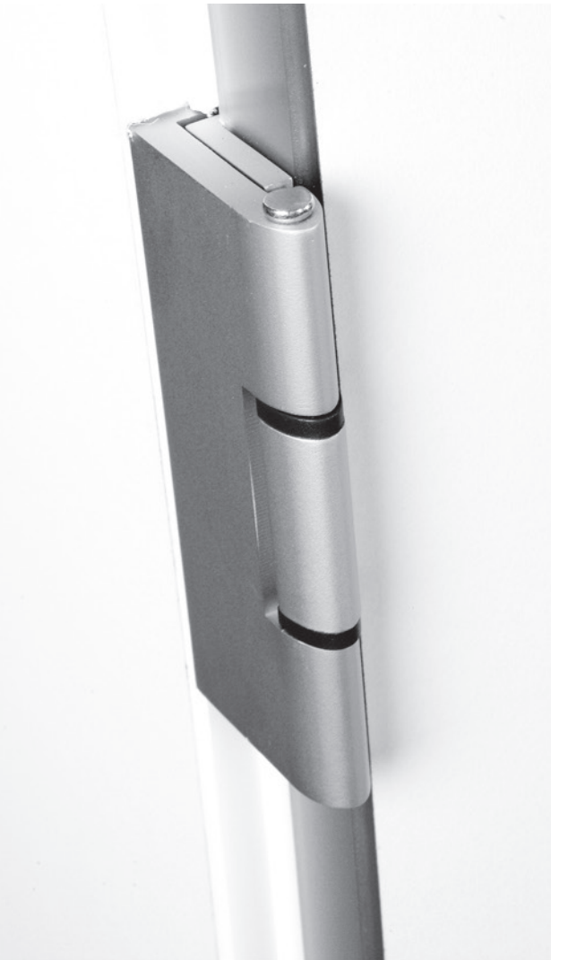
plan integrated no maintenance