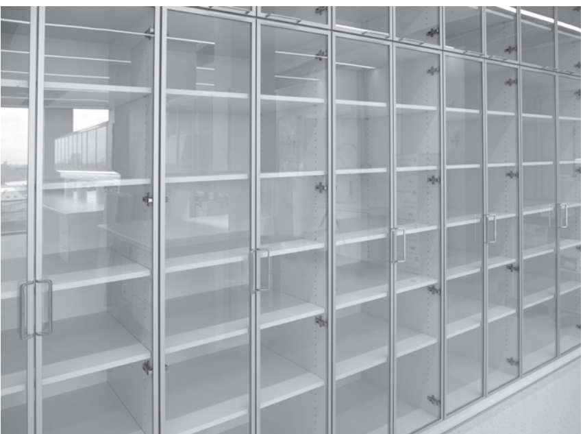
tall cabinet with alu display door